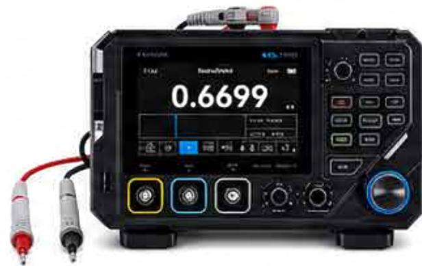
Digital Oscilloscope Multimeter / Signal Generator