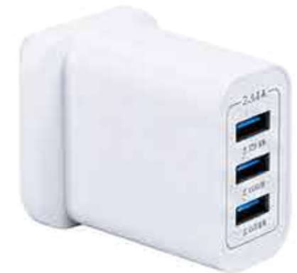
Multi Port USB Charger