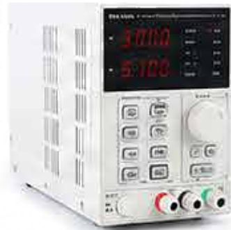
DC Power Supply